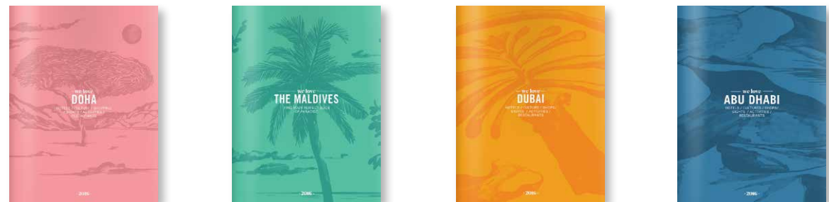
We Love Doha